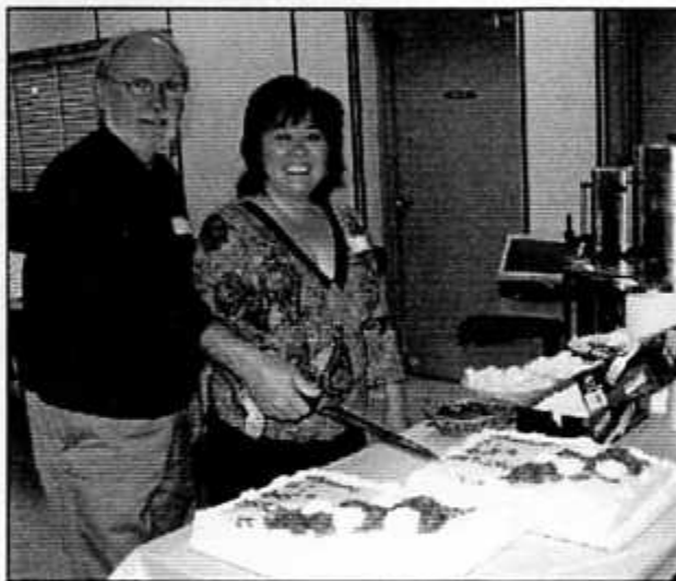
Cutting the cake.