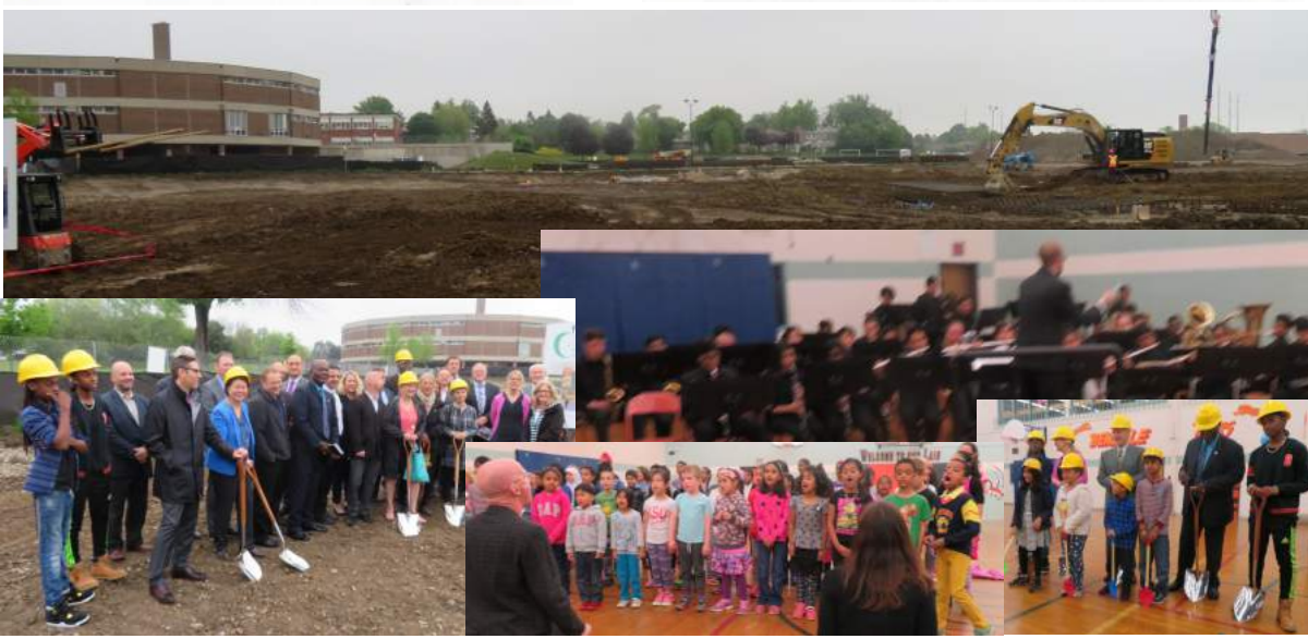
On June 5, 2017, ground was officially broken for construction of the new school. Ceremonies began indoors in the Bendale gym (the Thomson band, the Donwood choir plus a mix of children and adult dignitaries in the collage), then moved outdoors in sporadic drizzle to allow invited administration officials to put shovels in the ground (Highbrook in the background).