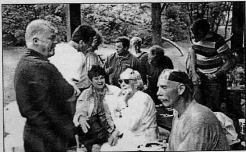
Members of the Thomson Park Alumni (see article on page four) reminisce and check old photographs at their 1995 picnic.

In other news, we have only two profiles this issue (deadlines!), but we have been able to include, at last, some of the reminiscences you provided in our first questionnaire/membership application. We are always open to suggestions (and volunteers) for profiles, articles, and activities. Keep in touch!