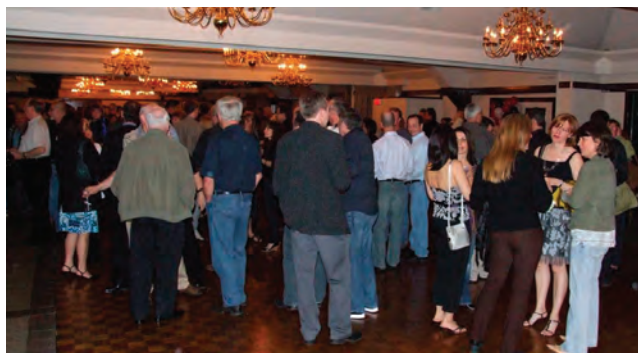
One view of the "dinning" guests