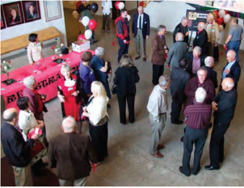
Task #1: getting the staff members out of the front foyer and into the staff lunch room.