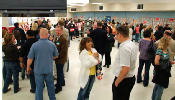
Views of the decorations and then the crowd of celebrants in the cafeteria, the 1980s room