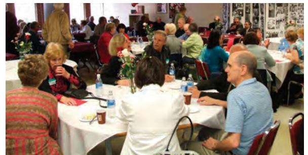
Sitting down to lunch at last