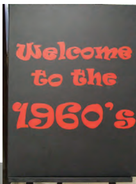
Below: Putting the finishing touches on the displays in the 1960s room - the Girls' Gym.

Right: At the other end of our 50 years, an appreciative group of grads (and grads-to-be???) examine the memorabilia in the 1990s-2000s room: 112.