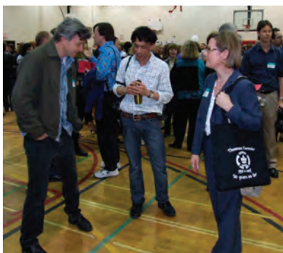
xxxx xxxxx, xxxx xxxxx and xxxx xxxxxx, who has bought a souvenir tote bag!