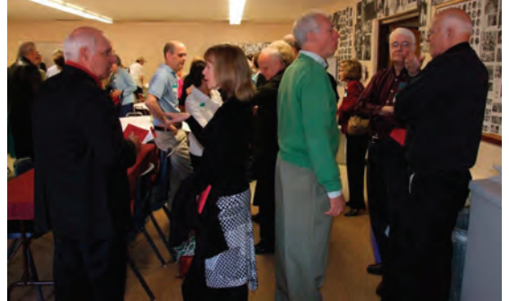
Whom can you identify from this group scene?