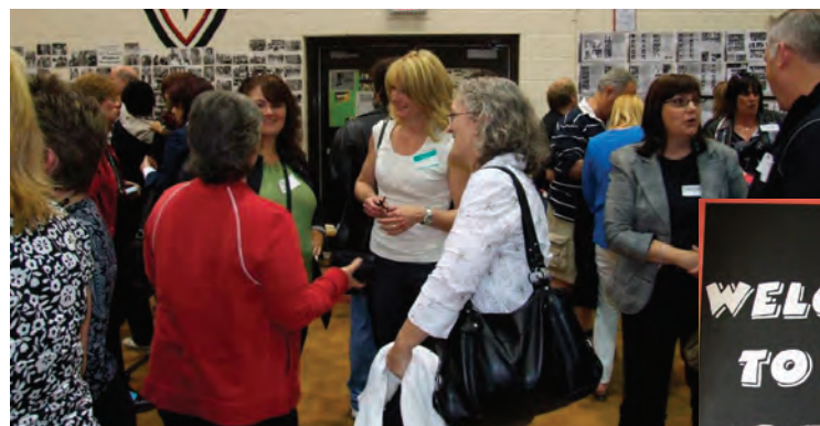
Two views of a crowded 1970s room (the Boys' Gym), where the two photos to the left were also taken