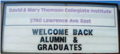
The outdoor sign issues a welcome to all.

Indoors, another welcome in front of the foyer school activities mural.