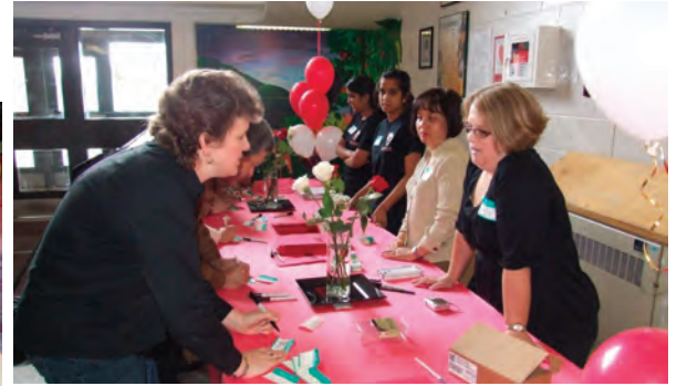
Above: Signing name tags at the registration desk

Below: The souvenir pick-up table (left), the Alumni table (right) and the Thomson Athletic Council refreshment and memory photos stand (centre distance) in the upper foyer