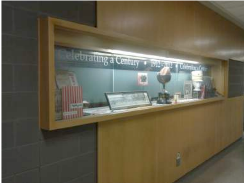
NTCI Alumni Room hallway entrance display